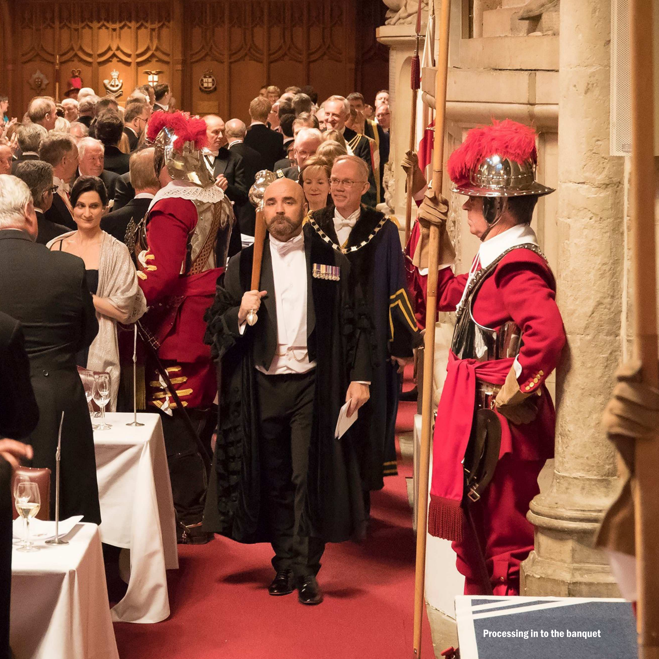
Processing in to the banquet